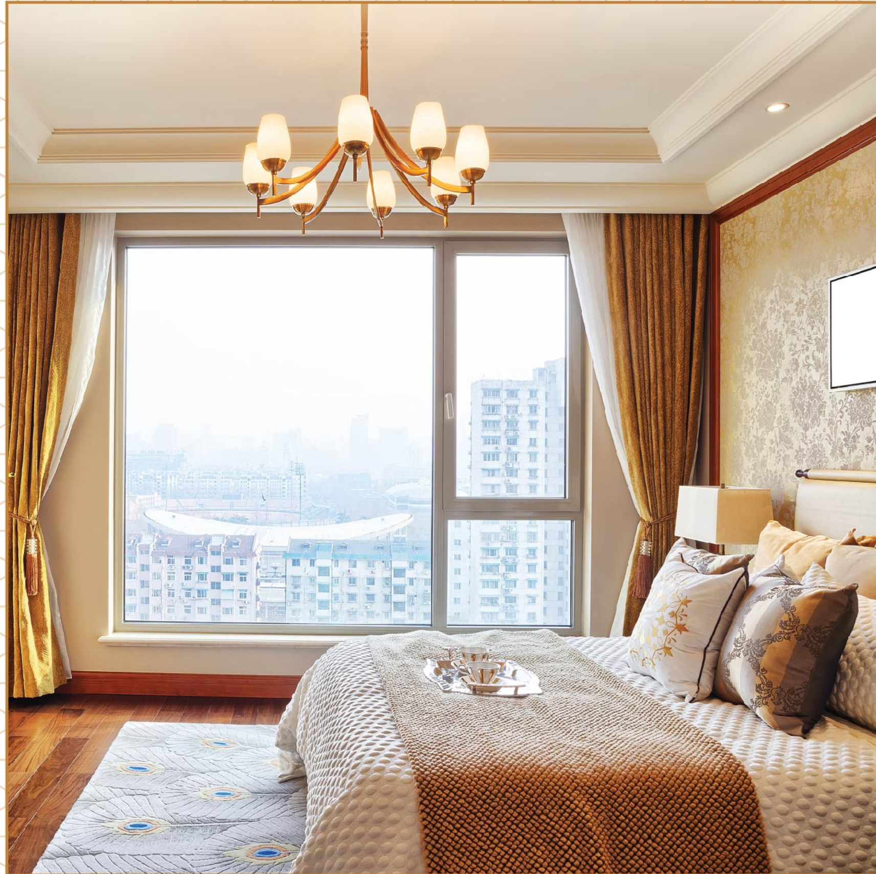
— Wooden flooring —