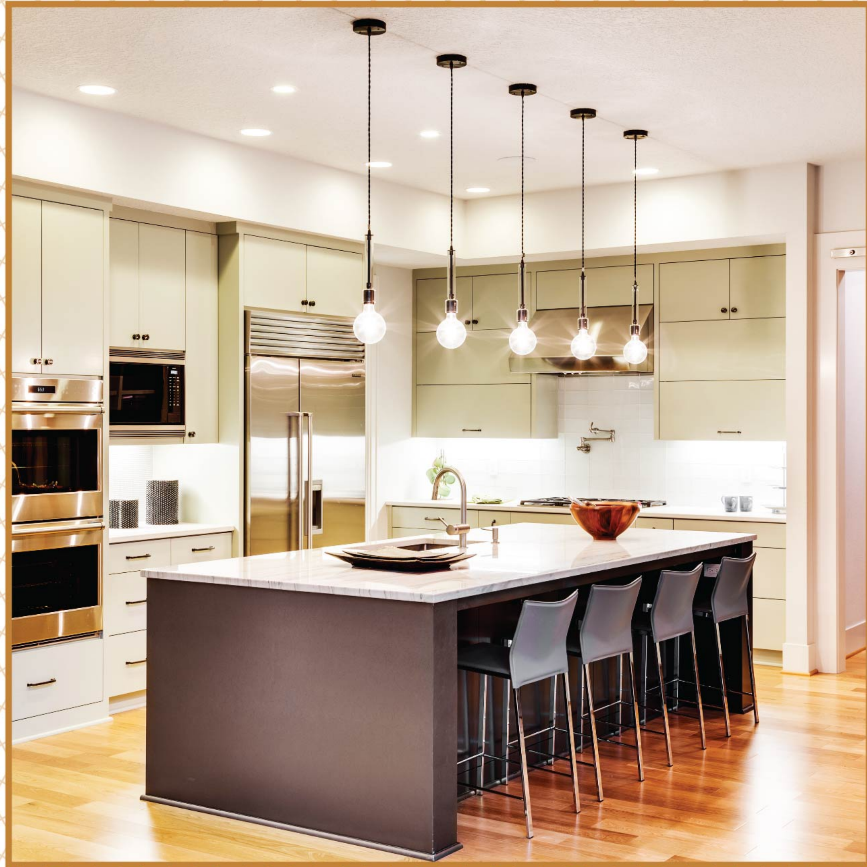
— Modular kitchen —