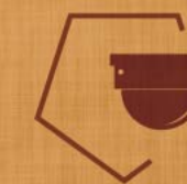
HI-TECH SECURITY SYSTEM