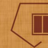
SOUNDPROOF SLIDING WINDOWS