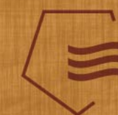
ROOFTOP SWIMMING POOL