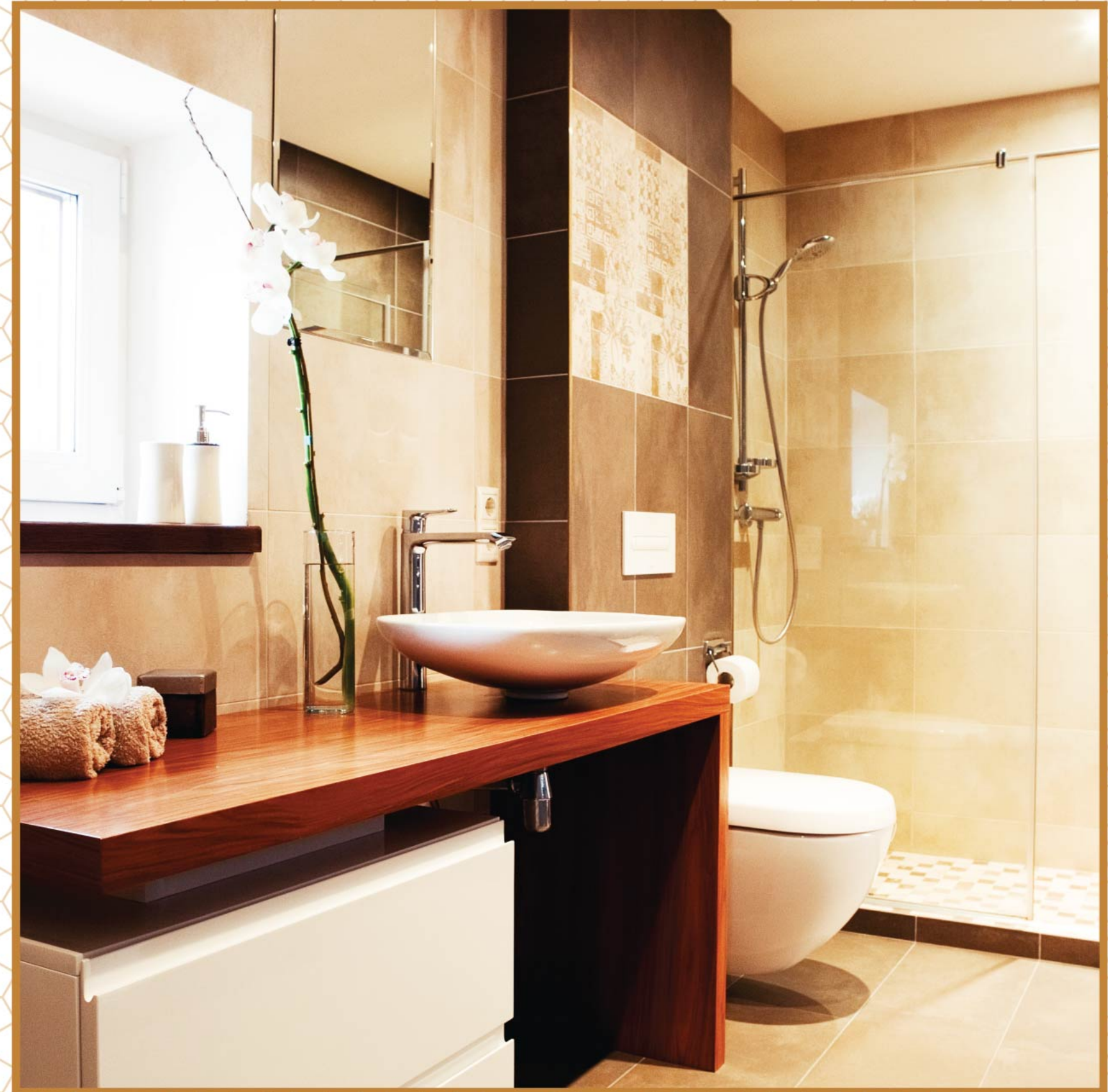
— Designer bath fittings —