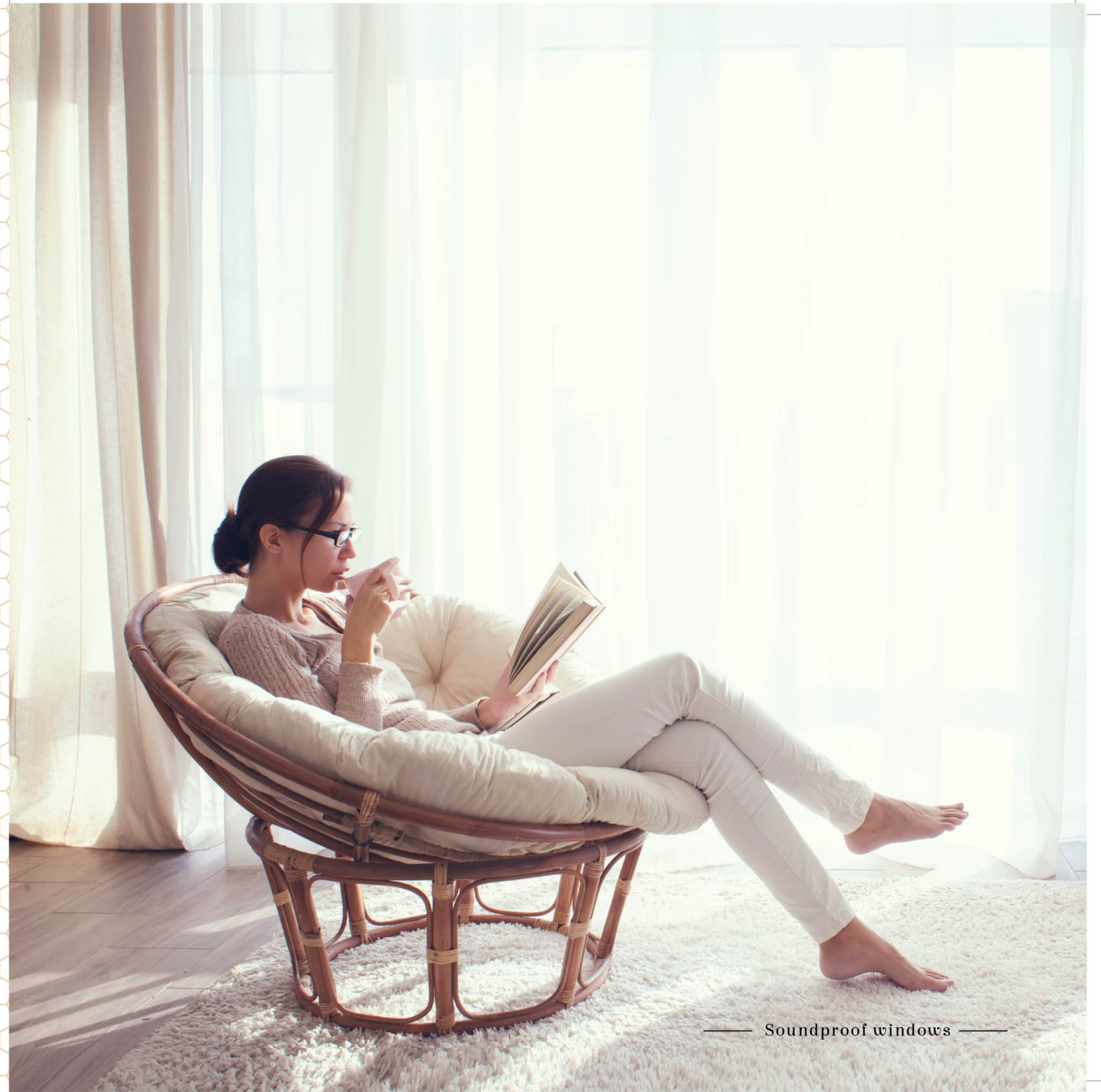
— Soundproof windows —