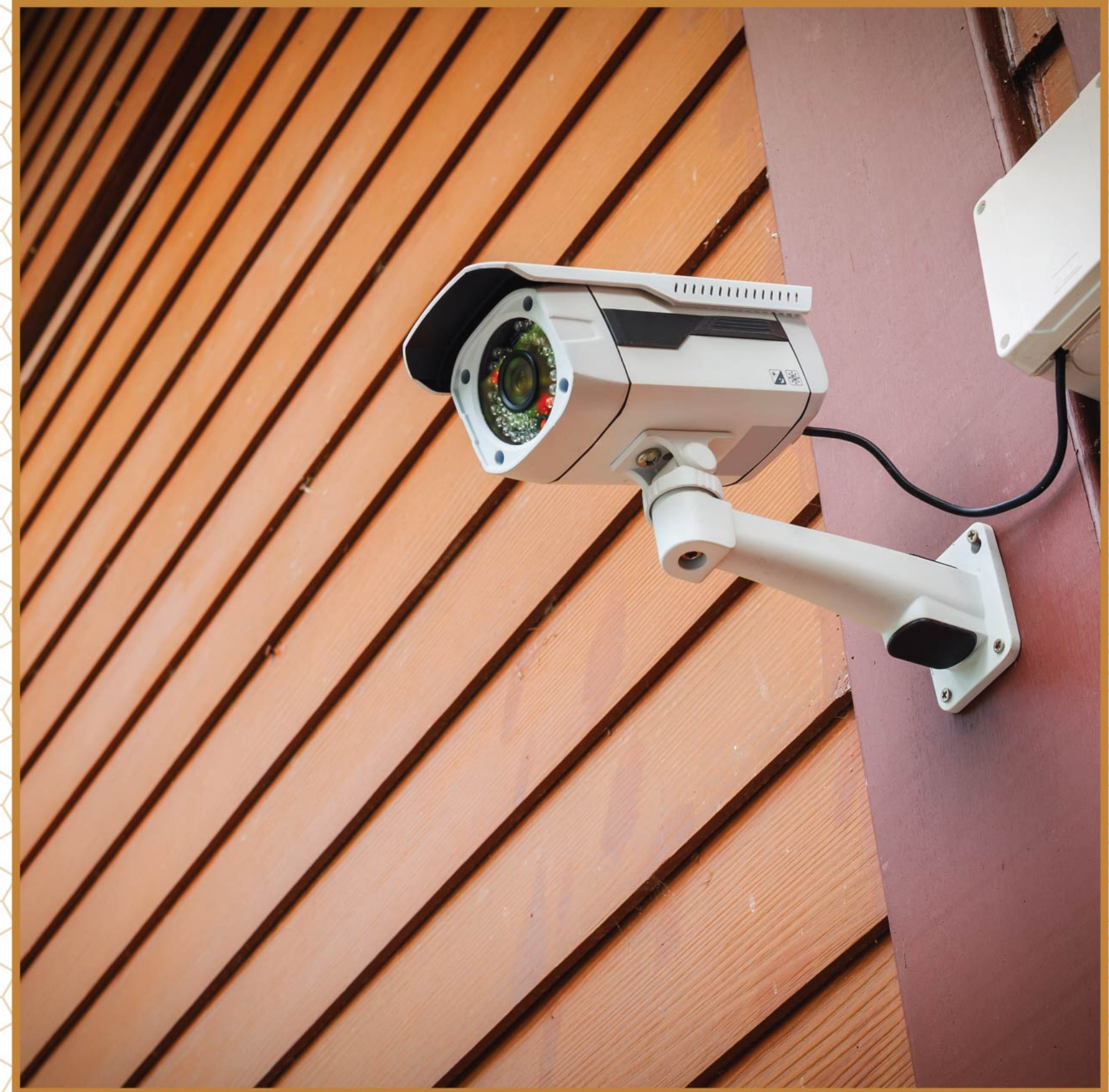
High tech surveillance system