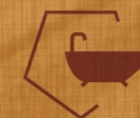
DESIGNER BATH FITTINGS