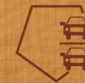
MULTI LEVEL CAR PARKING