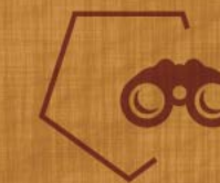
SCENIC VIEW OF THE ARABIAN SEA FROM EACH FLOOR