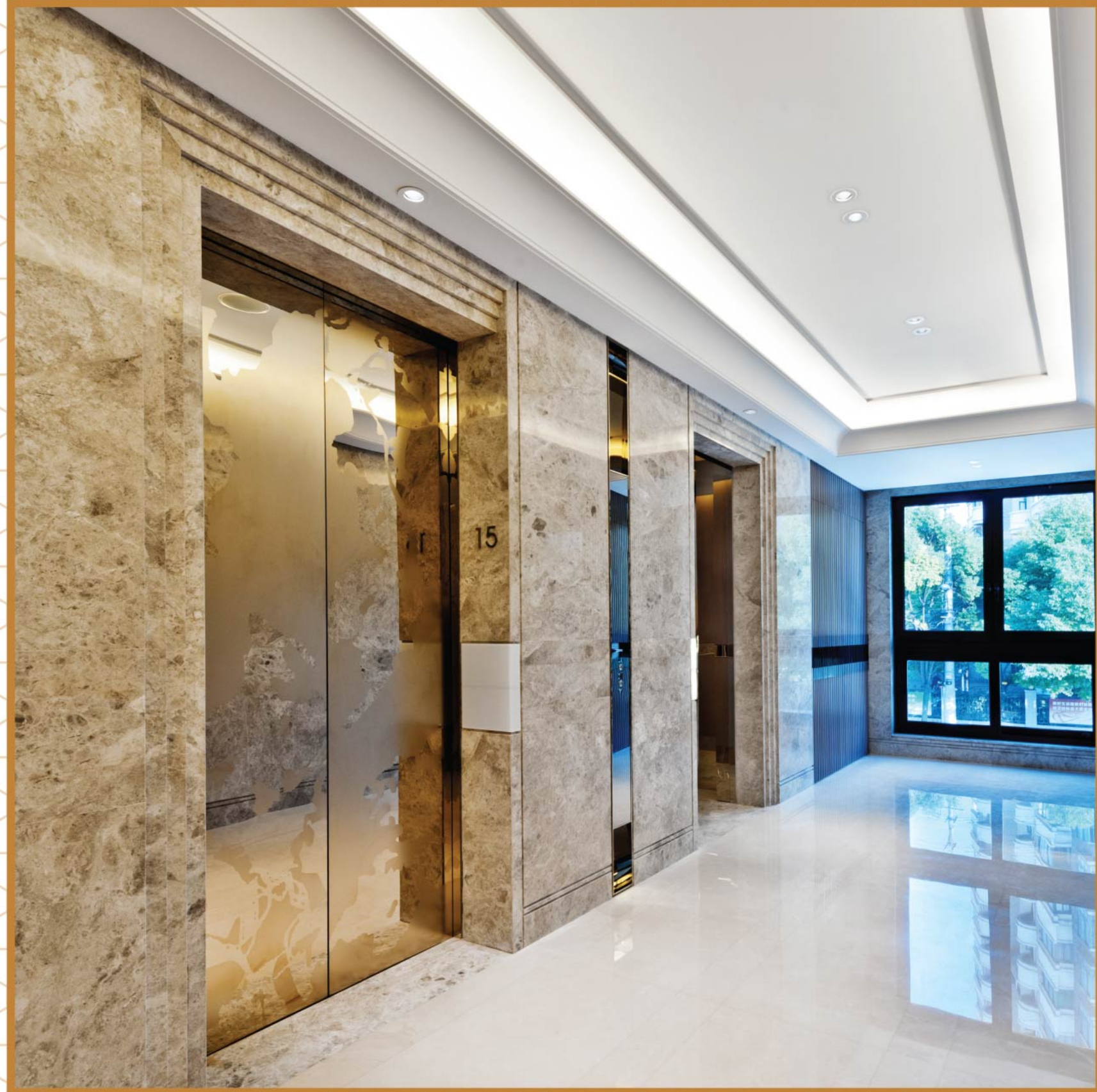
High speed elevators